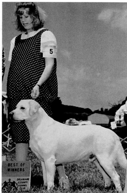
Ch Deck'Ins Sandstone Boomerang, "Boomer" (Ch Northwoods Sandman x Deck'Ins Nutmeg of Portledge)